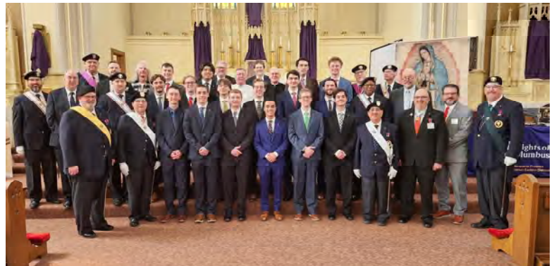
We welcome our newest Knights and Sir Knights to the Order. On March 23, Wisconsin welcomed 18 Sir Knights, 16 of which were from Marquette University (above). Bronislava Council #13880 holds an Exemption Ceremony (left).