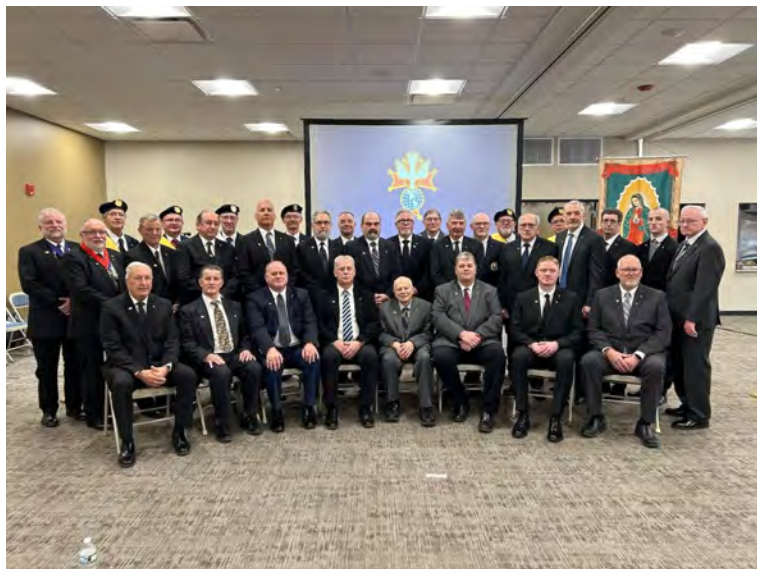
An exemplification class is held in Chippewa Falls.

144th Supreme Convention Denver, Colorado